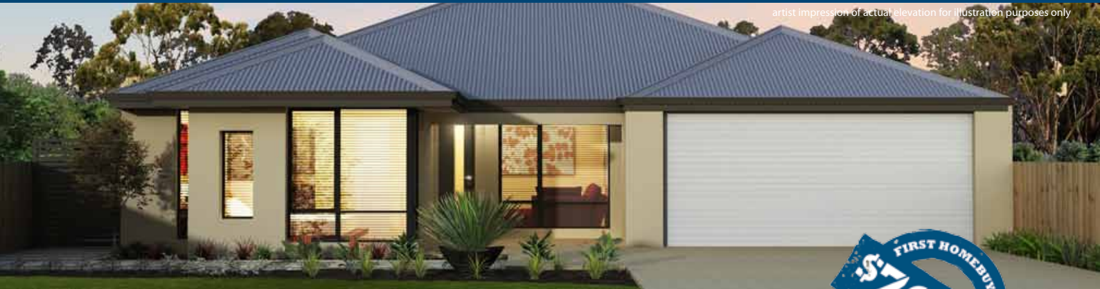
artist impression of actual elevation for illustration purposes only